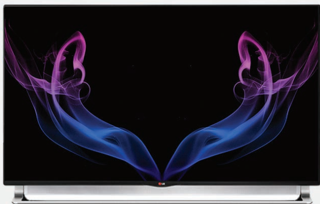
MT-VIKI's Product show

No power needed, support hot-plug, no software needed, strong compatibility